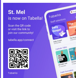
Tabella is a fully Catholic app where you can enjoy Catholic content to grow in the faith. The Tabella app is available in English/Spanish and has the biggest library of Catholic audio devotional content.

If you currently receive parish communications through Flocknote,