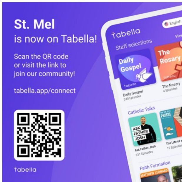
Tabella is a fully Catholic app where you can enjoy Catholic content to grow in the faith. The Tabella app is available in English/ Spanish and has the biggest library of Catholic audio devotional content.

If you currently receive parish communications through Flocknote, be sure to download this app to your phone as it will eventually replace Flocknote for parish communications. This app is very easy to use and when there is a post from us you will get a push notification on your phone. In the meantime, use all the resources available on this app to nurture your faith.